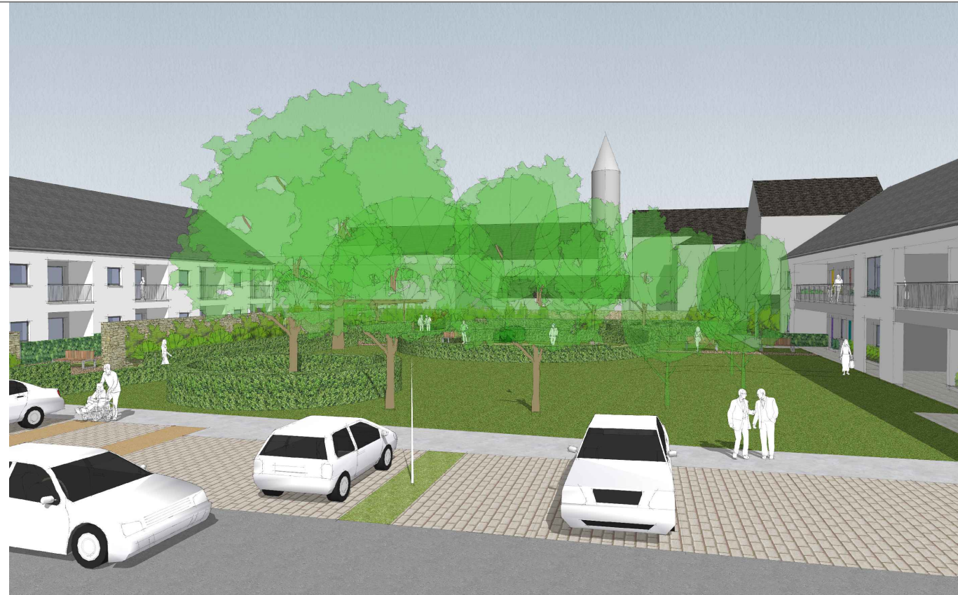
Proposed 3d View No. 2