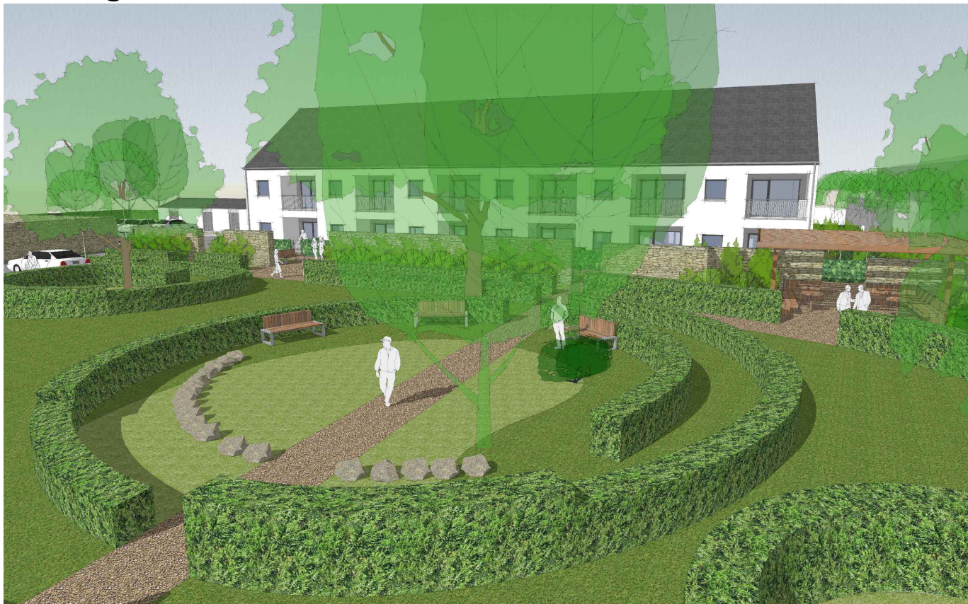
Proposed 3d View No. 3