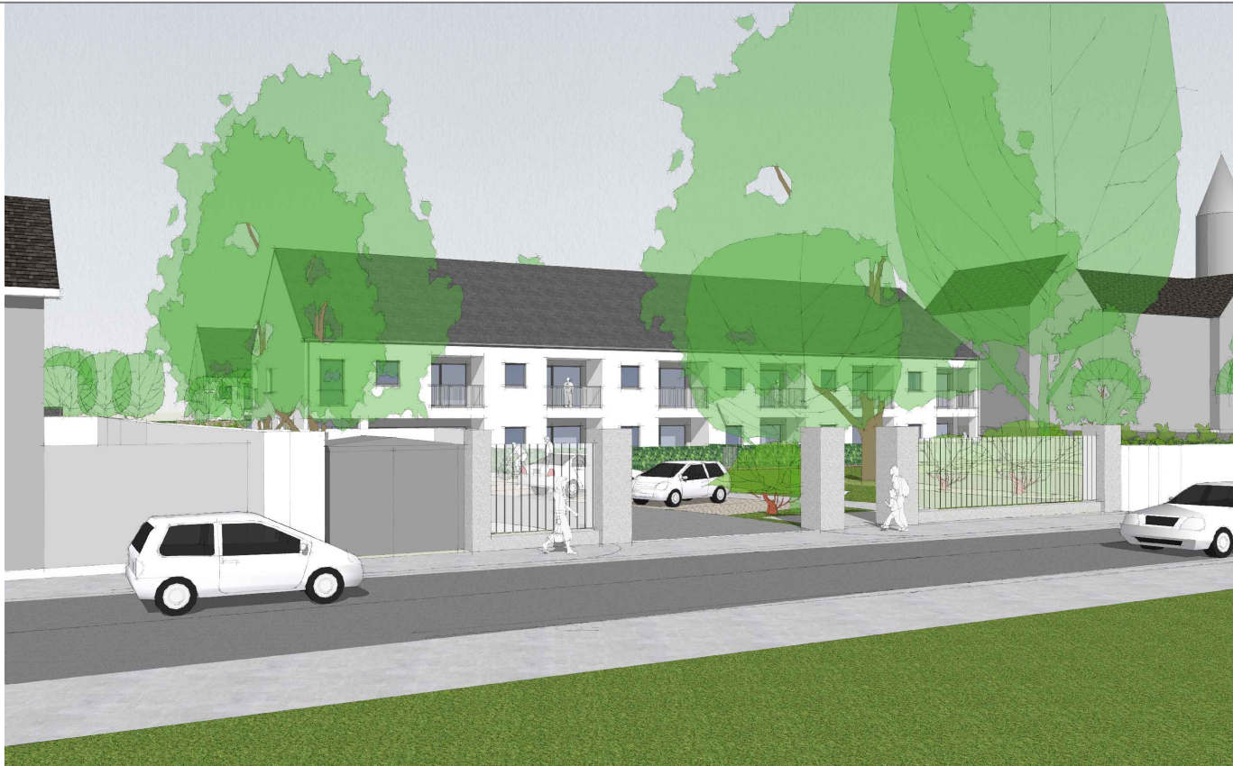
Proposed 3d View No. 1